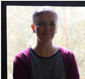
Facing away from window

Dark environments impact the overall quality of your video because cameras do not perform well in dim lighting. Ensuring you are well lit guarantees the camera and therefore, your audience, can see you clearly. Look for a room in your home that has lots of natural light. If you are using light from a window, ensure you are facing towards the window so light falls on you directly.