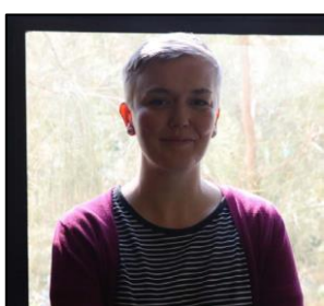
Facing away from window

Dark environments impact the overall quality of your video because cameras do not perform well in dim lighting. Ensuring you are well lit guarantees the camera and therefore, your audience, can see you clearly. Look for a room in your home that has lots of natural light. If you are using light from a window, ensure you are facing towards the window so light falls on you directly.